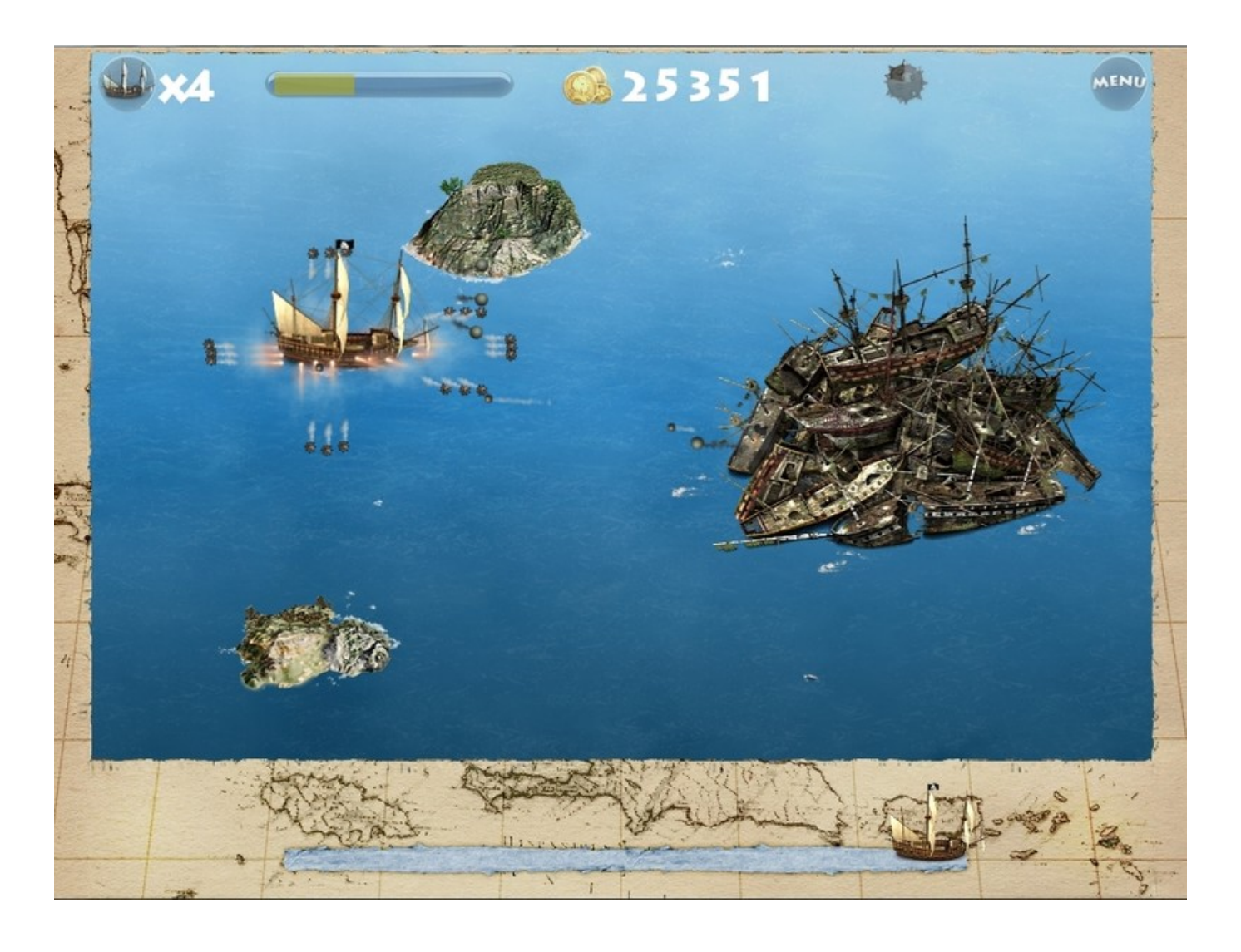
Revenge Of Roger Rouge Activation Code Crack

Download ->>> <a href="http://bit.ly/2NFuIk2">http://bit.ly/2NFuIk2</a>